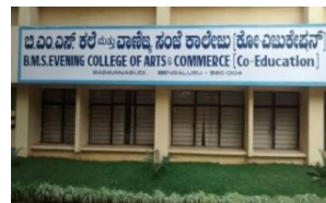
B.M.S. EVENING COLLEGE OF ARTS AND COMMERCE Bugle Rock Road, Basavanagudi, Bengaluru – 560019 Ph: +91 80 26601836