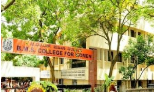
B.M.S. COLLEGE FOR WOMEN Bugle Rock Road, Basavanagudi, Bengaluru – 560019 Ph: +91 80 26601836