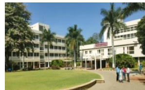
B.M.S. COLLEGE OF ARCHITECTURE Bull Temple Road, Bengaluru – 560019 Ph: +91 80 26622130/35