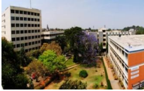
B.M.S. COLLEGE OF ENGINEERING Bull Temple Road, Bengaluru – 560019 Ph: +91 80 26622130