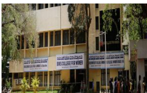
B.M.S. COLLEGE OF ARTS AND COMMERCE Bugle Rock Road, Basavanagudi, Bengaluru – 560019 Ph: +91 80 26601836