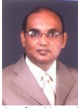
Hon'ble Mr. Justice Nagarjuna Reddy Former Judge, High Court of Andhra Pradesh