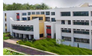
B.M.S. INSTITUTE OF TECHNOLOGY AND MANAGEMENT Avalahalli, Yelahanka, Bengaluru – 560064 Ph: +91 80 28561576